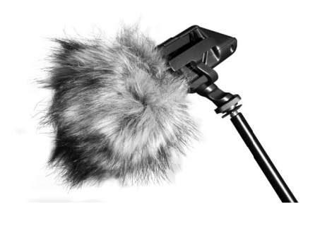
Dead Kitten Windscreen